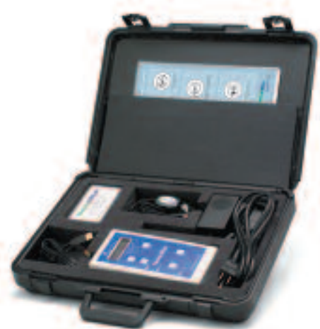
29440 OAE Hearing Screener Carrying Case (optional)

29428 OAE Adolescent Foam Ear Tips, 100/bag