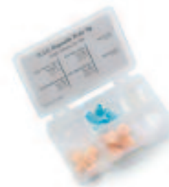
29420 OAE Ear Tip Sampler Pack

For more information on the OAE Hearing Screener or an in-office demonstration, contact your local distributor or call Welch Allyn at 1.800.535.6663.