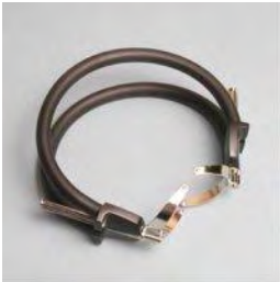
Standard Headband for TDH headphone type headphones. Part Number HB-7