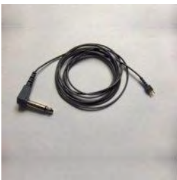
Grason Stadler Bone Cord, dark grey straight cable with angle plug. Part Number 4204-0145