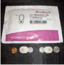
Ambu EP/ENG Electrodes. 25 disposable electrodes per package. A US Nickel and US Penny added to picture to give size perception. Part Number 72000-S-25