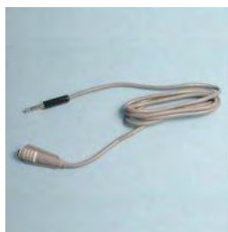
Patient Response Switch. Part Number AP2-M