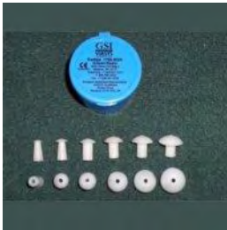
Grason Stadler Screen Tip Kit, 6 sizes, 2 of each. Part Number 1700-9620