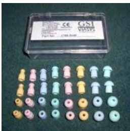
Grason Stadler Screen Tip Kit, 8 sizes, 4 of each. Part Number 1700-9660