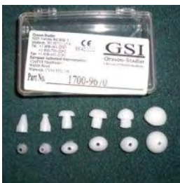
Grason Stadler Oblong Tip Kit, 6 sizes, 2 of each. Part Number 1700-9670