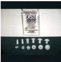
Grason Stadler Screen Tip Kit, 6 sizes, 2 of each. Part Number 1700-9622