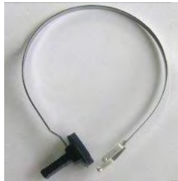
Standard Bone Headband for all type bone oscillators. Part Number P-3333