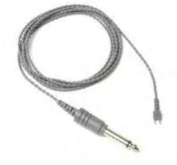
Standard Bone Cord, grey braided. Part Number P-3024